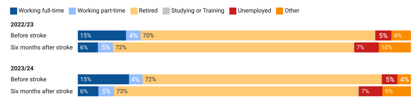
Figure 1: Comparison of employment status of stroke patients before stroke and at 6 months after stroke, between April 2022-March 2023 and April 2023-March 2024. This only includes those patients that had a 6 month review (39% of applicable patients in 2023/24).

6.2% of patients have been supported to continue working full-time and 4.7% part-time at 6 months after stroke compared to 15.4% working full-time and 4.1% part-time before stroke in 2023/24 (fig. 1). Vocational rehabilitation is a key component of an integrated community stroke service and NHS England have developed a <u>vocational rehabilitation toolkit</u> to support clinicians, commissioners and leaders to maximise the chances of people returning to work after a stroke through a personalised approach.